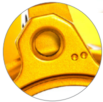
Double Dot 150/157 Super Boost