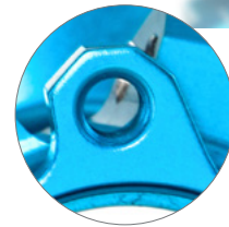
No Dot 142/135