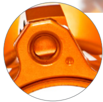
Single Dot 148 Boost